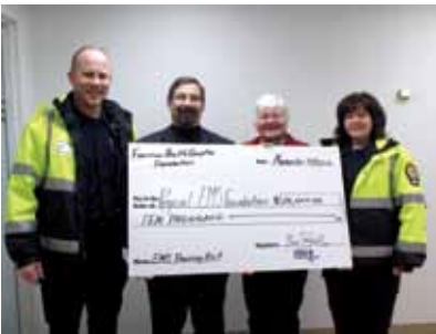
Fairview Health Complex Foundation presents a cheque to the REMS Foundation for $10,000 for the North Sim Unit.